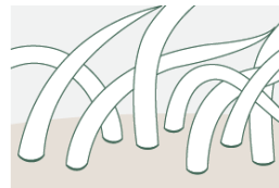
Untreated fine hair