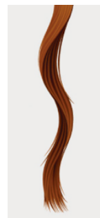
Untreated hair (illustration)

Hydrolyzed wheat protein and certified organic aloe blend expands when hair is wet and retracts when hair is dry to enhance wave or curl