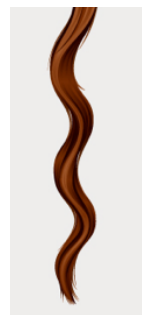
Hair treated with Be Curly™ Shampoo and Conditioner (illustration)